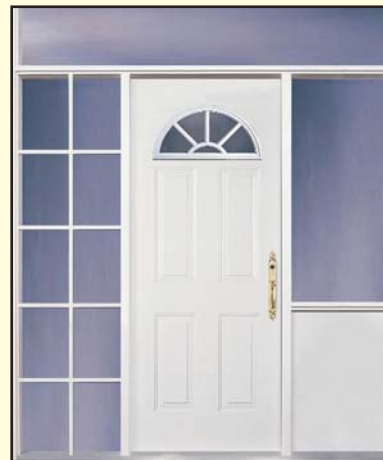
Optional steel kick panel shown

If your entry requires special sizing consider replacing custom sized sidelites or doors with direct glazed sidelites and/or transoms. Using twin sealed glass units installed directly into the prehung frame saves time and money compared to the cost and delay of factory ordered, custom built sidelites or doors.