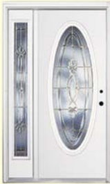
Sidelite/Door (shown) or Door/Sidelite