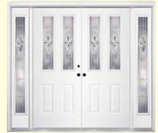
Double Door/ Double Sidelite